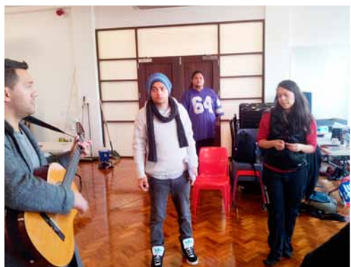
Rehearsal